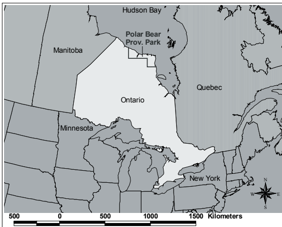
Figure 1. Location of Polar Bear Provincial Park, Ontario.

Throughout the 1950s and 1960s there was a rapid increase in the recorded harvest of polar bears ( Ursus maritimus ) throughout the circumpolar Arctic (Prestrud and Stirling, 1994). In response to this significant threat to the survival of polar bear populations, the five nations with jurisdiction over areas where polar bears occur (Canada, Denmark, Norway, USA, and USSR) entered into lengthy negotiations that culminated in the signing of the International Agreement on the Conservation of Polar Bears and their Habitat in 1973 (Prestrud and Stirling, 1994).