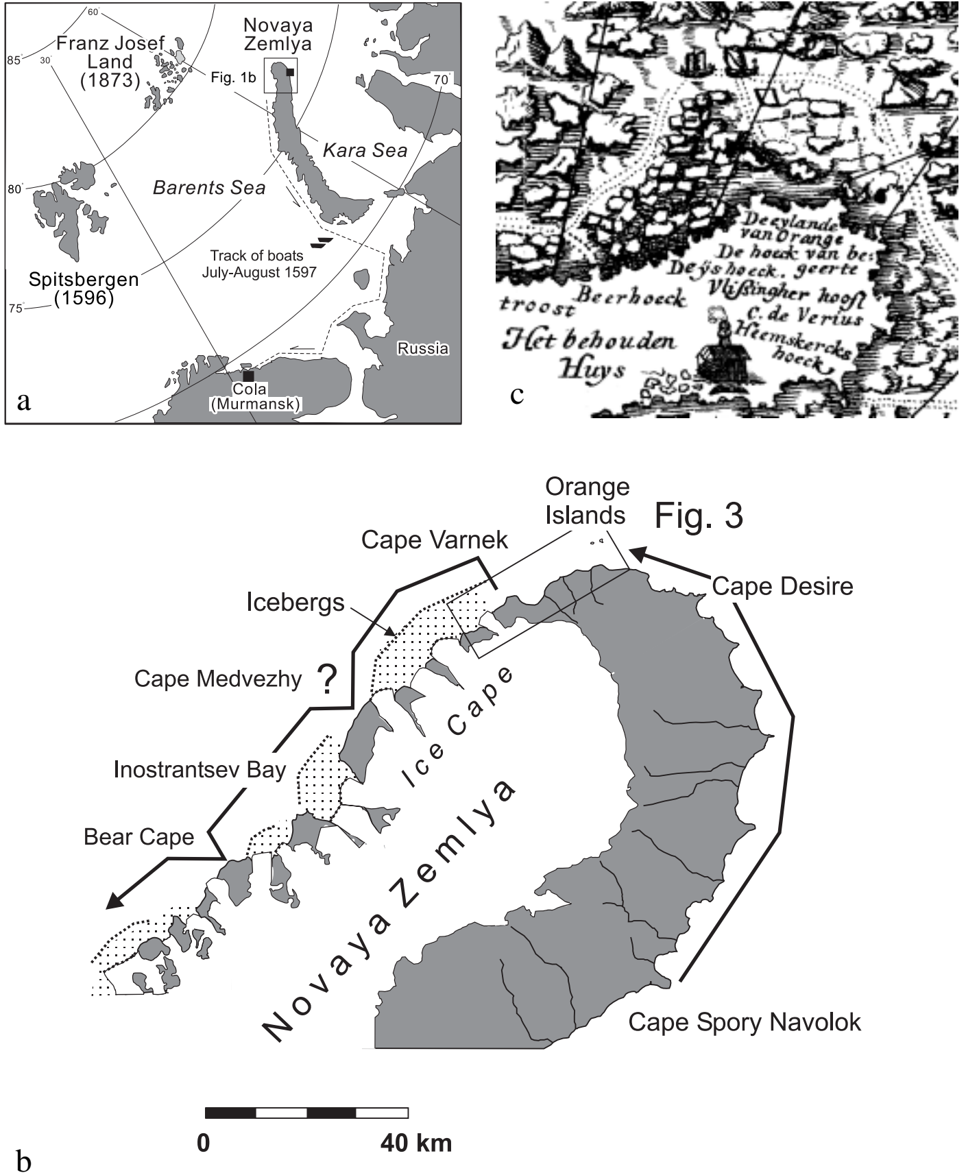
FIG. 1. (a) Location of northernmost Novaya Zemlya. (b) Location of sites discussed in text. (c) Inset of Barents' map from De Veer (1598): The increased density of sea ice near the north cape of Novaya Zemlya may reflect iceberg calving. The track plotted on this map suggests that the Dutch maneuvered around the iceberg area before they continued along the coast.