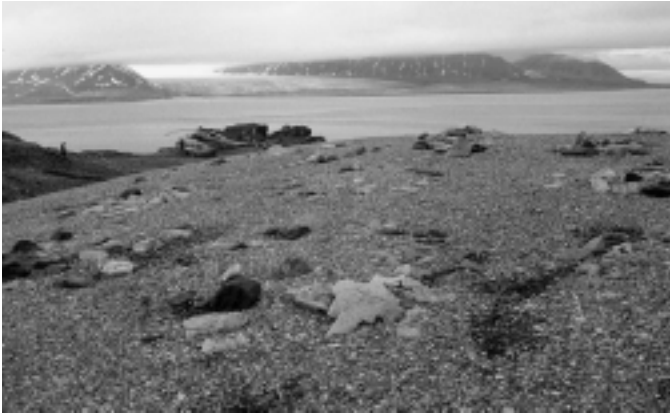
FIG. 2. Whaler graves at Bellsund, east coast of Recherchefjorden, southwest Spitsbergen, on a raised beach 18–20 m asl. Beach construction of pebbles and gravel is similar to that of beaches on north Novaya Zemlya.