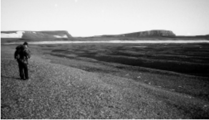
FIG. 8. Beach ridges ~5 m asl and escarpment at Cape Varnek, the most probable location of Barents' and Andriesz' grave.

Andriesz were buried on the beach of Cape Varnek, but this grave was destroyed during storm surges.